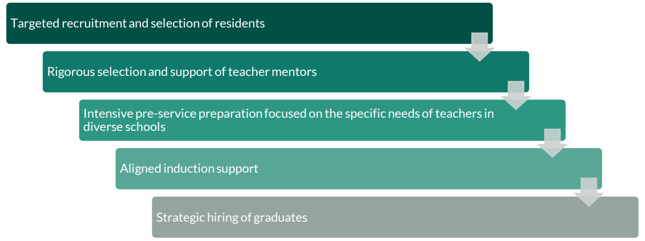
Figure 2.2: Steps to Developing and Supporting Teacher Residency Programs

Source: National Center for Teacher Residencies<sup>47</sup>