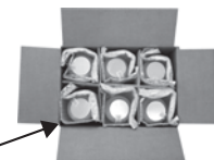
250 mL Water Sample Bottles