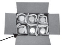
250 mL Water Sample Bottles