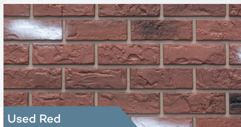
Colors are shown as accurately as the printing process allows