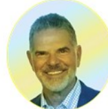
JACK MYERS MEDIA VILLAGE