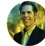
DADE HAYES DEADLINE