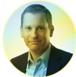
SCOTT BENDER PROHASKA CONSULTING