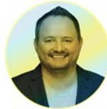
RAOUL MARINESCU PLUTO TV