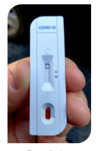
Result 1: One Line

Results of 1 (one) line means the individual doesn't have COVID-19 and has never had