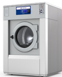
Wascomat WUD Series 30-75lb. Models Design and Construction.