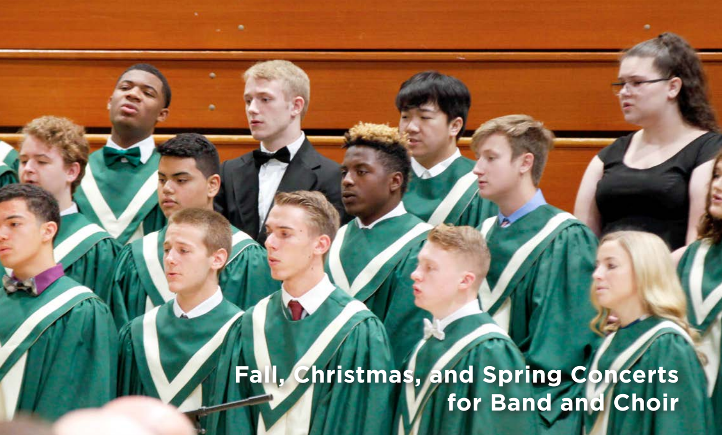
Fall, Christmas, and Spring Concerts for Band and Choir