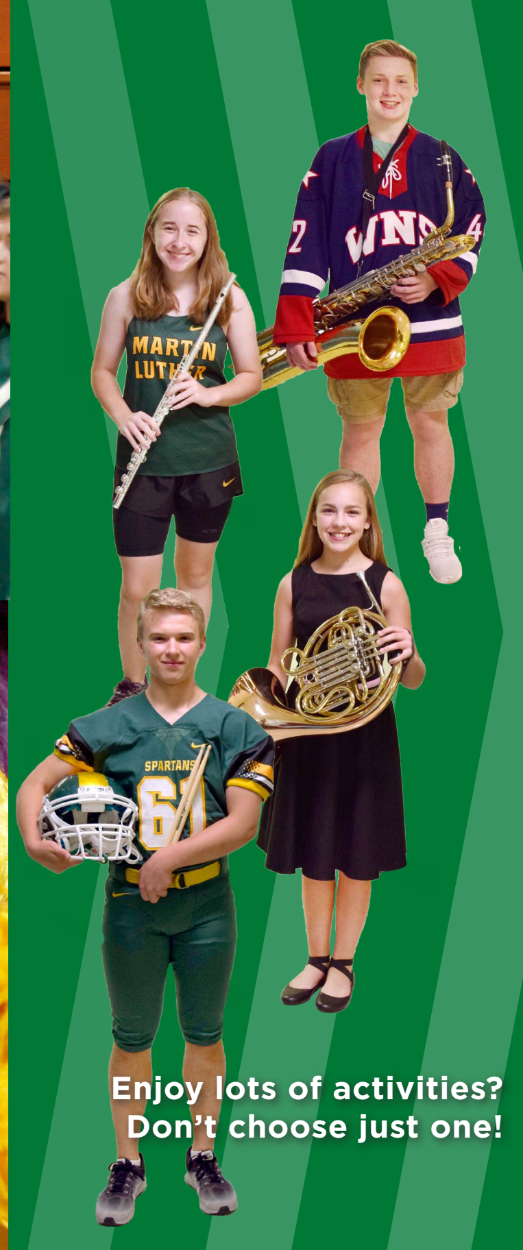
Enjoy lots of activities? Don't choose just one!