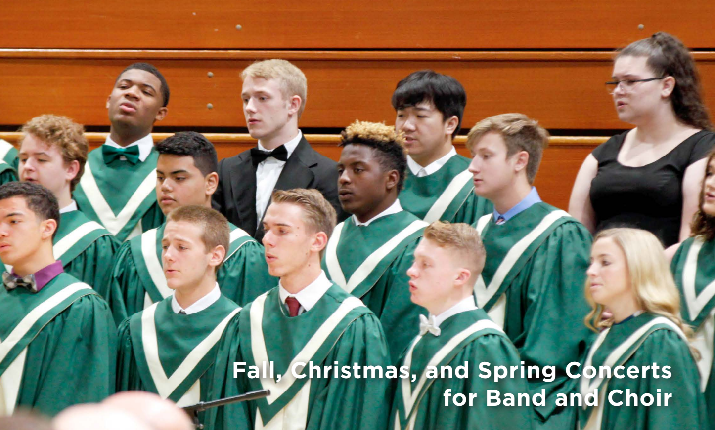
Fall, Christmas, and Spring Concerts for Band and Choir