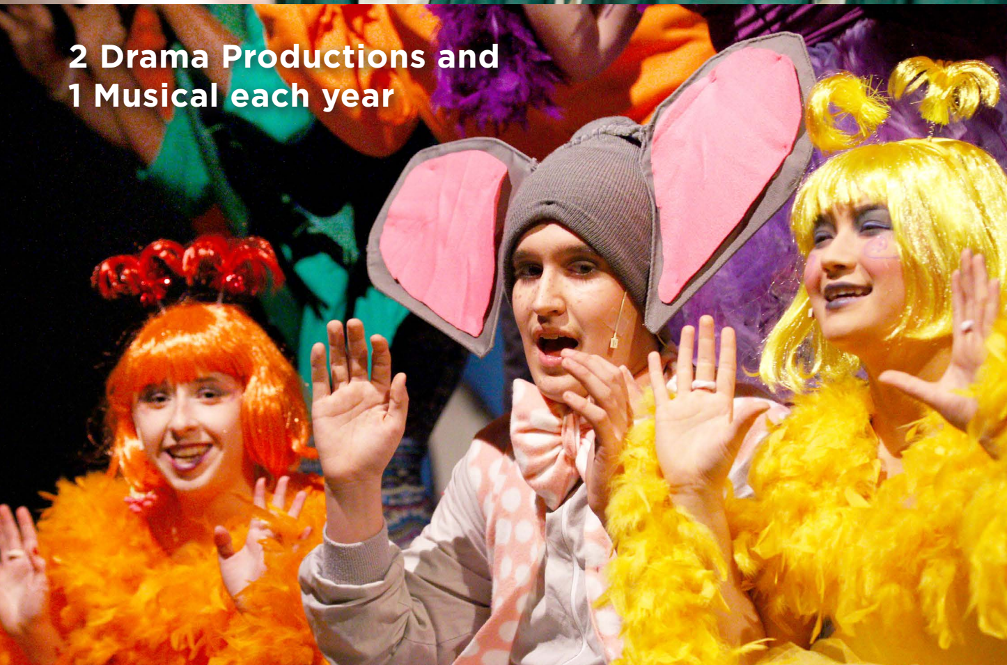
2 Drama Productions and 1 Musical each year