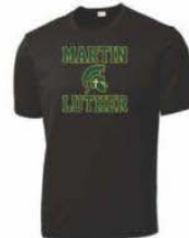
5 Color Option(s) $15.00 Sport-Tek Adult PosiCharge Competitor Tee.