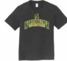
4 Color Option(s) $13.00 Port & Company &#174; Youth Fan Favorite Tee.