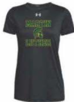
3 Color Option(s) $28.75 Womens UA W's Locker Tee 20