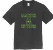
4 Color Option(s) $13.00 Port & Company &#174; Youth Fan Favorite Tee.