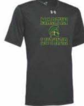
3 Color Option(s) $28.75 Mens UA Locker Tee 20 SS