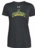
3 Color Option(s) $28.75 Womens UA W's Locker Tee 20