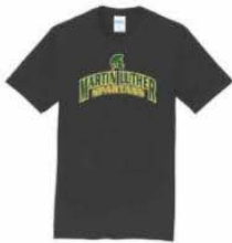
4 Color Option(s) $13.75 Port & Company &#174; Fan Favorite Tee