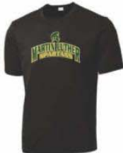
5 Color Option(s) $15.00 Sport-Tek Youth Competitor Tee.