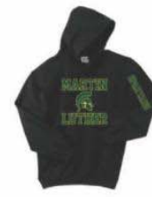
3 Color Option(s) $40.00 Gildan &#174; - DryBlend &#174; Pullover Hooded Sweatshirt