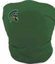
1 Color Option(s) $10.50 Gaiter Mask