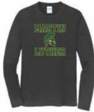
4 Color Option(s) $15.25 Port & Company &#174; Long Sleeve Fan Favorite Tee.