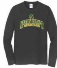
4 Color Option(s) $15.25 Port & Company &#174; Long Sleeve Fan Favorite Tee.