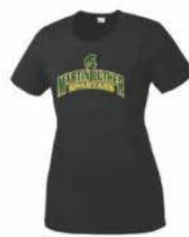
5 Color Option(s) $15.00 Sport-Tek Ladies PosiCharge Competitor Tee