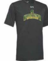
3 Color Option(s) $28.75 Mens UA Locker Tee 20 SS