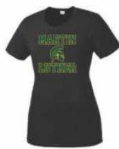
5 Color Option(s) $15.00 Sport-Tek Ladies PosiCharge Competitor Tee