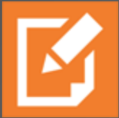
Registration & Waivers