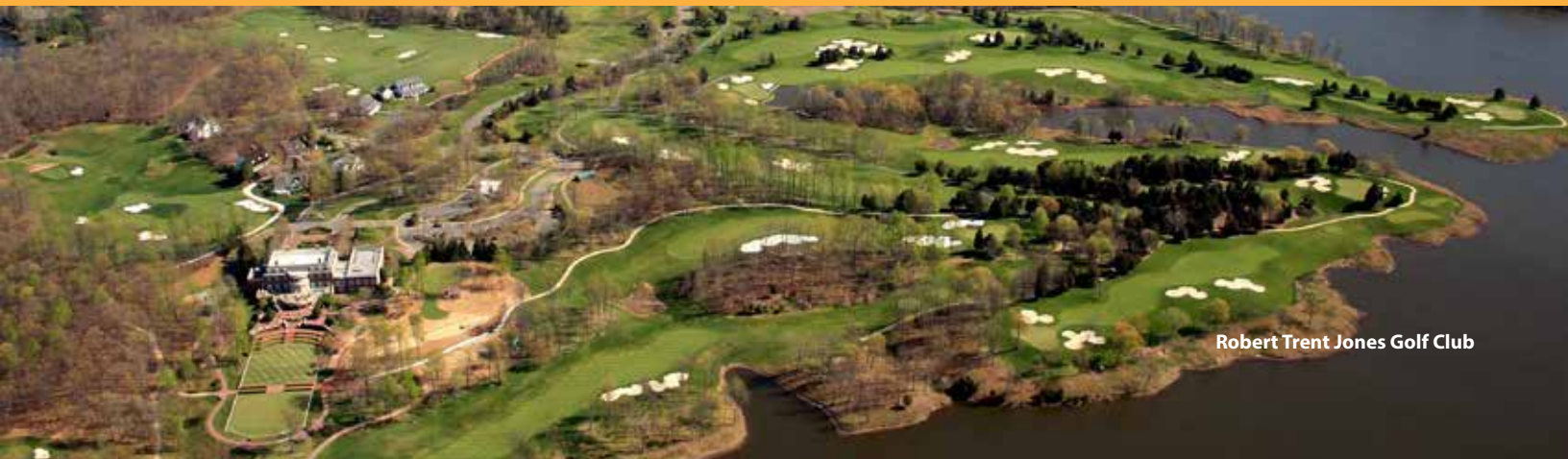
Robert Trent Jones Golf Club

July 27 – August 2, 2015 | Robert Trent Jones Golf Club