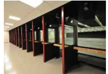
Elite Shooting Sports New Facility