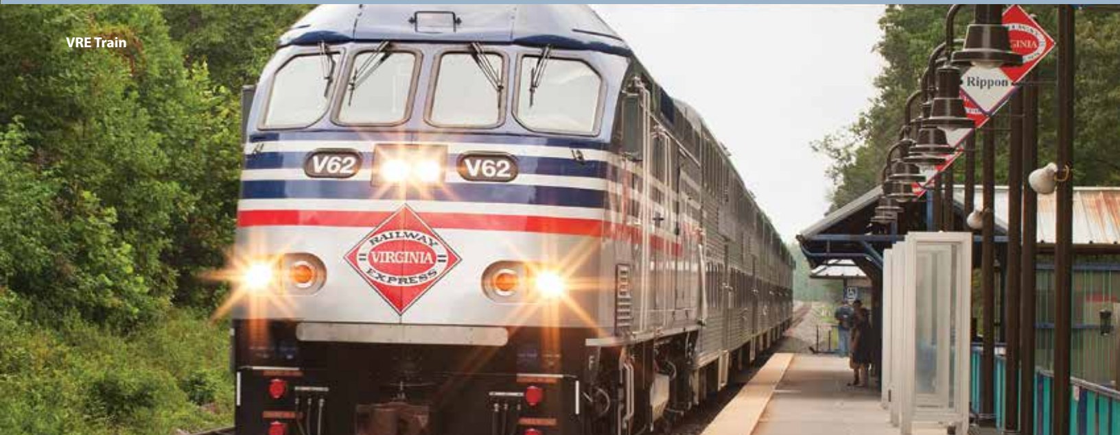
Virginia Governor Terry McAuliffe Joins Groundbreaking for New VRE Station At Potomac Shores