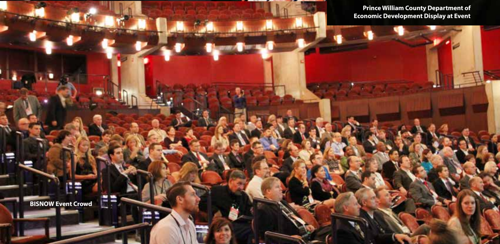
BISNOW Event Crowd