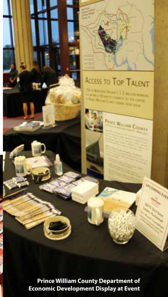
Prince William County Department of Economic Development Display at Event