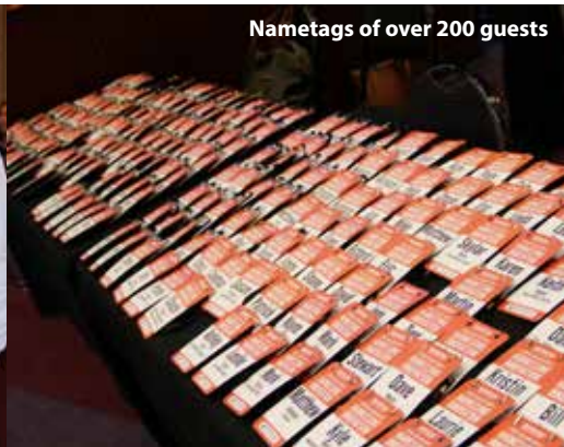
Nametags of over 200 guests