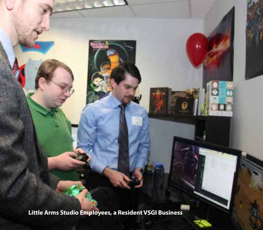
Little Arms Studio Employees, a Resident VSGI Business