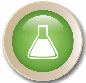
Life Sciences & Biotechnology

Prince William County's business value proposition stretches across the County with economic transformation focused on four target industry sectors: life sciences and biotechnology; information technology; federal agencies and corporate headquarters, and the specialized logistics and supply chain.