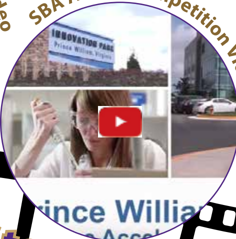
SBA Award Competition Video