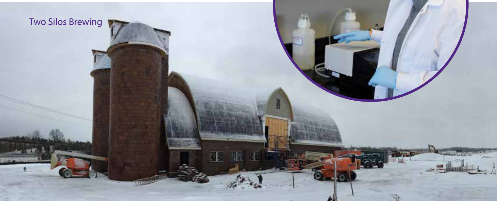
Two Silos Brewing