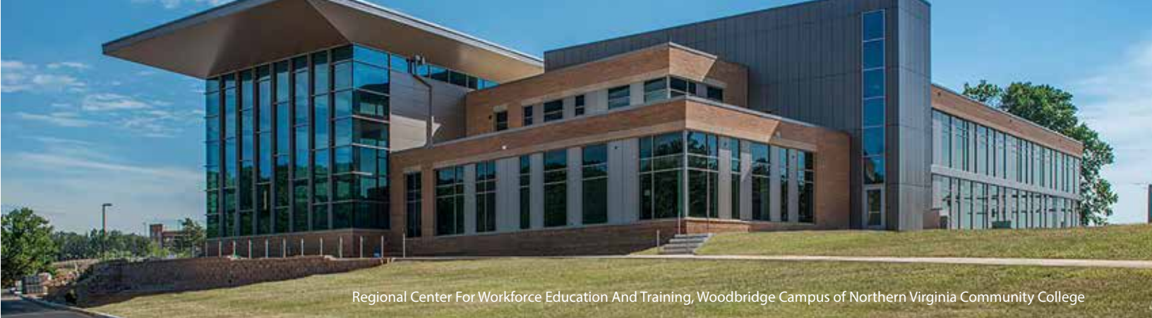
Regional Center For Workforce Education And Training, Woodbridge Campus of Northern Virginia Community College