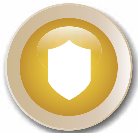
Federal Agencies & Corporate Facilities