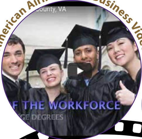
American Airlines Talk Business Video