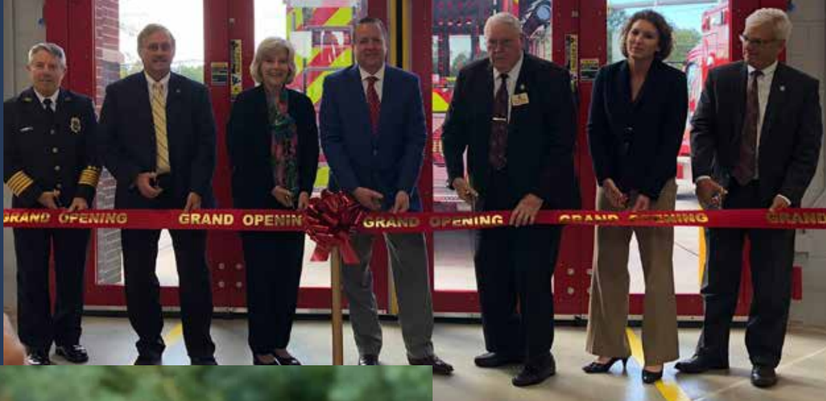
Prince William County Fire Station 26 Ribbon Cutting