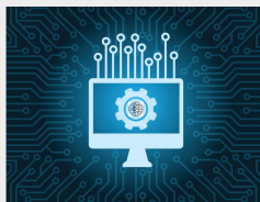
The National Cancer Institute Awarded Contract to Develop an Oncology Based Artificial Intelligence-Enabled Clinical Trial Recruitment Tool