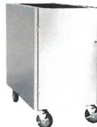
Base Cart 3 Barrel Part #12-2516-0001