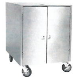
Base Cart 4 Barrel Part #12-2899-0001