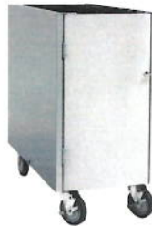
Base Cart 2 Barrel Part #12-2493-0001 (#12-2493-0007 for 352)