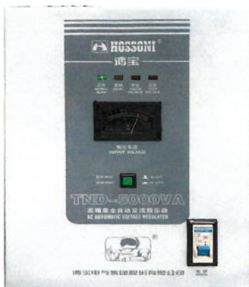
Automatic Voltage Regulator

Includes L6-30P plug, L6-30R plug, & 8-ft power cord.