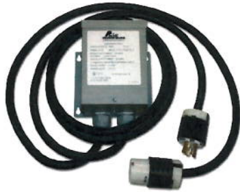
Buck and Boost Transformer

Frozen Beverage Dispensers EVERYONE LOVES FROZEN™