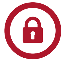
User roles & access controls