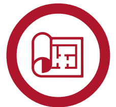
Custom maps & floor plans