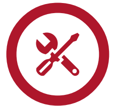
Wireless device configuration