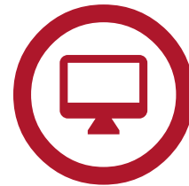
Alert management tools