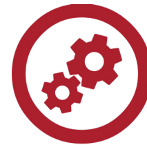
Custom alert profiles