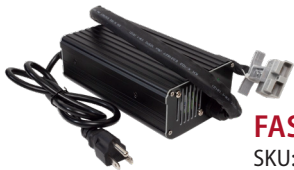
FAST BATTERY CHARGER SKU: ACC-G7EXO-FAST-CHARGER-NA