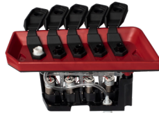
PUMP MODULE MODULE* SKU: ACC-G7EXO-PUMP