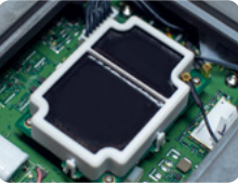
G7 EXO SATELLITE MODULE* PART NUMBER: ACC-G7EXO-SAT