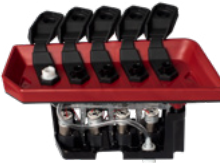
PUMP MODULE MODULE* PART NUMBER: ACC-G7EXO-PUMP