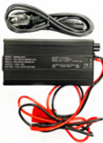
FAST BATTERY CHARGER PART NUMBER: ACC-G7EXO-FAST-CHARGER-EU