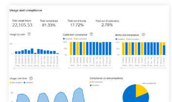
Blackline Analytics reporting platform