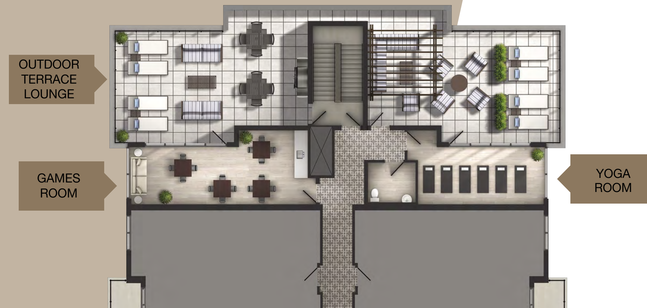
12TH FLOOR ROOFTOP/TERRACE WITH SPECTACULAR PANORAMIC VIEWS