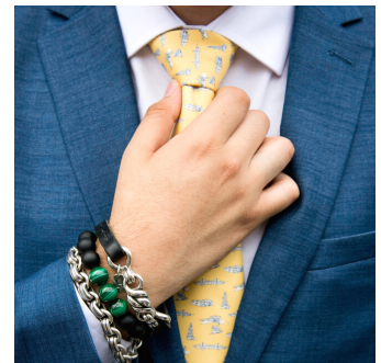
Ties & Gift Items