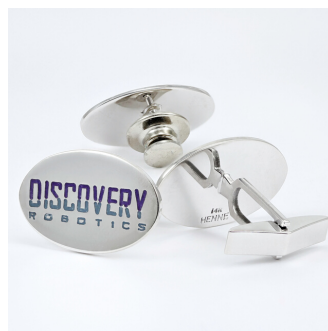
Cufflinks & Pins