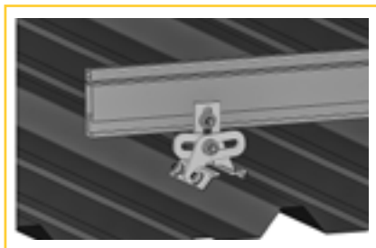
Side Mount Rail