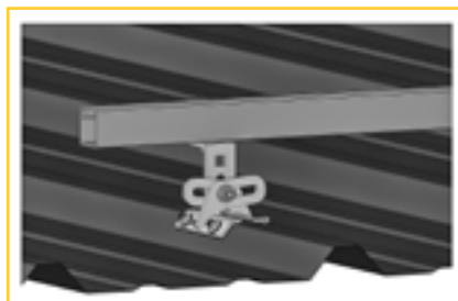
Bottom Mount Rail