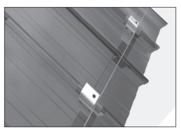
Use a string line to properly align clamps

*Be sure the project has been engineered, and note that this product can be combined with the S-5-K Grip and S-5-GX 10 insert if multiple rows are required.