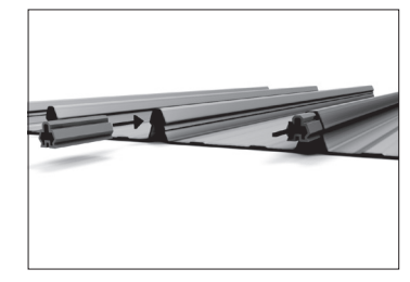
Slide the 3" insert in the bottom of the panel