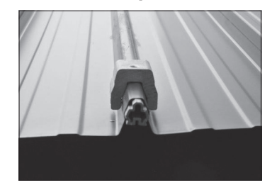
Example of correctly installed S-5-KHD clamp