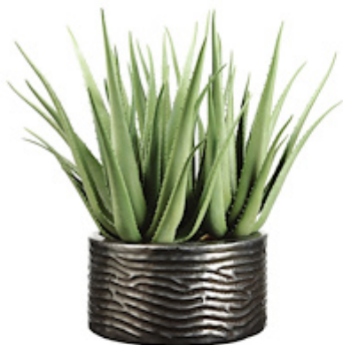
Allstate Floral's 28-inch Agave plant is in a ribbed planter. Dallas, Atlanta