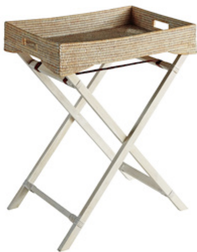
Napa Home & Garden's Burma tray table is made from rattan in a whitewash. Dallas, Atlanta