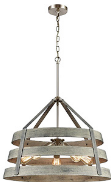
The Brigantine pendant from ELK Group International is finished in weathered driftwood and satin nickel. Dallas, Atlanta