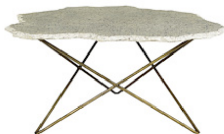
Inspired by the Amalfi Coast, Moe's Home Collection's Positano coffee table is made from rough-edged white terrazzo and a slim antique-brass-finished iron base.