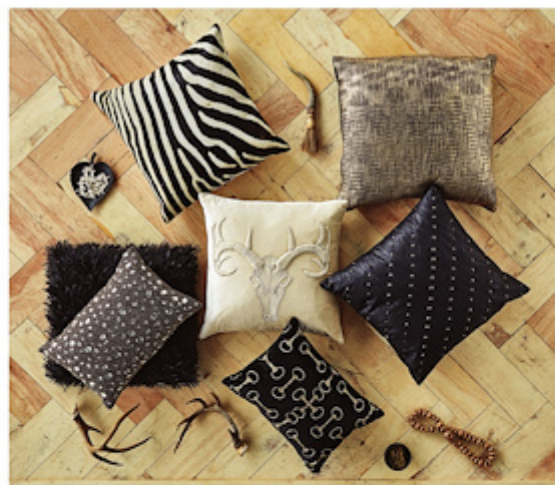
The Denver Collection from Cloud9 Design is a modern, western pillow collection with intricate additions like hand-beading and printed leather. Dallas