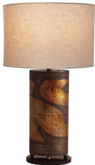
Global Views' Currents lamp is inspired by natural water movements and is brass-clad on a wooden sub structure. Dallas, Atlanta