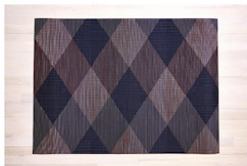
The Signal woven floor mat from Chilewich explores the interaction of shape, color and texture with a jacquard weave. Los Angeles, New York, Atlanta