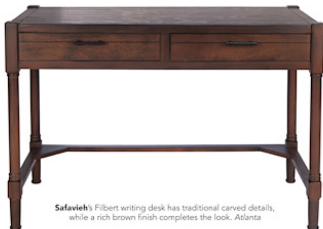
Safavieh's Filbert writing desk has traditional carved details, while a rich brown finish completes the look. Atlanta