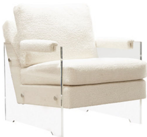
Pasha Furniture's Carson chair has an acrylic base and is available in more than 1,000 fabrics. Dallas, Atlanta