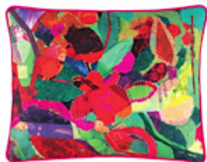
Annie Selke's Bunny flower felt-embroidered pillow packs a punch of color. Atlanta