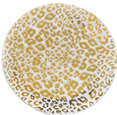
A bold animal print covers a round plate with 24k gold from Annie Glass . Dallas, Atlanta