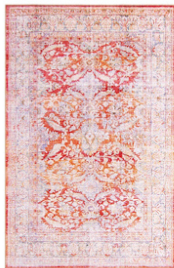
Unique Loom's Revival Collection combines traditional floral and tribal designs with bold contemporary colors. Dallas