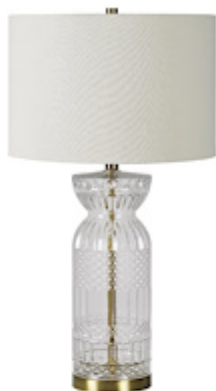
Renwil's Badalone table lamp is made of clear glass and has antique brushed brass plated accents. Dallas