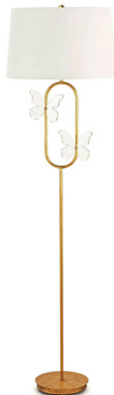
The Monarch floor lamp by Regina Andrew has a steel frame dusted in a light gold lead finish and is set off by two clear glass butterflies. Atlanta