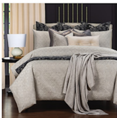
The Deco Platinum Primo Bedding Collection, part of the F. Scott Fitzgerald Bedding Collection from Siscovers , features a diamond pattern woven in platinum and pearl with a stitched floral pattern in the Euro pillows.