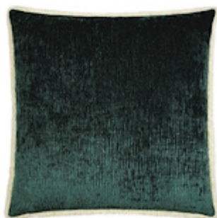
D.V. Kap's Kinney pillow boasts rich emerald green chenille with a faux shearling cord. Dallas, Atlanta