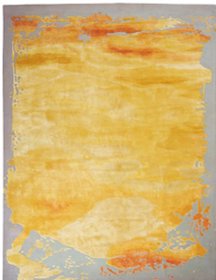
Included in Nourison's Prismatic Collection, gold and beige tones shimmer in a luxurious blend of wool and silk-like Luxelle fibers. Dallas, Atlanta