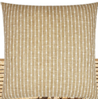
D.V. Kap Home's Kemp pillow in the color Harvest has a globally textured stripe pattern and is available in multiple colorways.