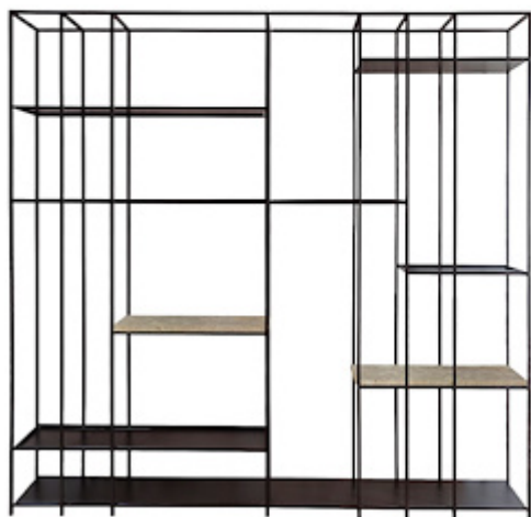
The Geneva rack from Dome Deco is made with metal and travertine. Dallas, Atlanta