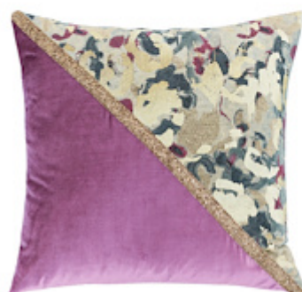
Color-blocking with a metallic abstract print and mulberry-toned velvet and glitter adorns Eastern Accents' decorative pillow from the Valentina Collection.