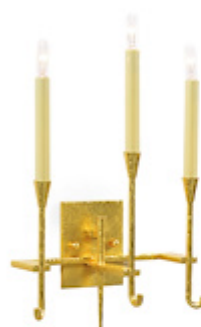
Hammered gold leaf over steel and three electrified candles define the Diego sconce from Wildwood . Atlanta