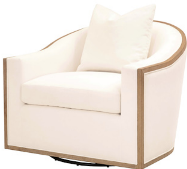
The Paxton swivel club chair from Essentials for Living is made in a high performance fabric and has a 360 degree swivel mechanism.