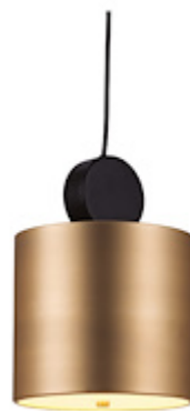
Zuo's Maritzia ceiling lamp features a modern and sleek shape made from gold plated steel.