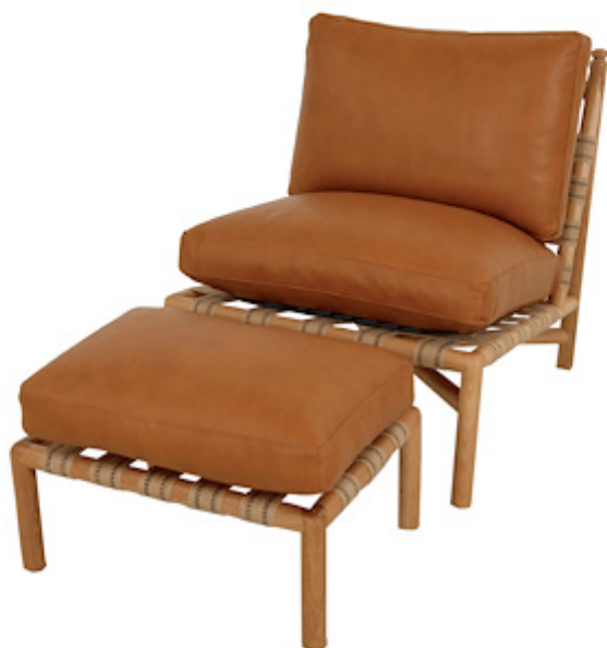
The Flannery chair and ottoman from Norwalk Furniture features organically woven striped detailing, in 800 fabrics or 100 leather options.