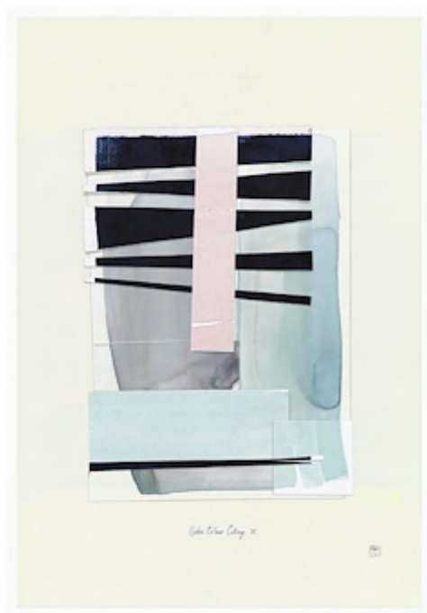
Celadon Art's 'Water Colour Collage IV' has cool tones with delicate hand embellishments, layering a variety of pastels with sharp white contrasts. Dallas, Atlanta