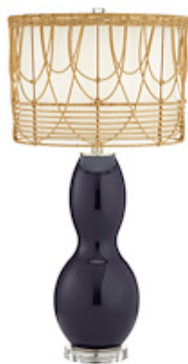
Pacific Coast Lighting's Mila lamp features a natural rattan drum shade atop a dark blue crystal base.