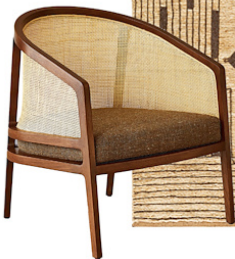
Global Views' Reed cane-back chair sits extra deep with a solid walnut frame and rattan woven panels.