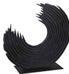
Phillips Collection's Swoop black wood sculpture offers an organic look. Dallas