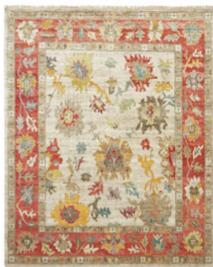
Hand-knotted using a combination of hand-spun wool and silkette yarns, Kalaty Rug Corporation's Adana Collection brings vibrant colors that update the motifs and patterns. New York, Atlanta