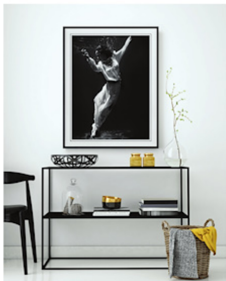
Grand Image Home's vintage black and white fashion photograph is an archival digital print on paper, matted and framed under glass and available in two sizes. Atlanta