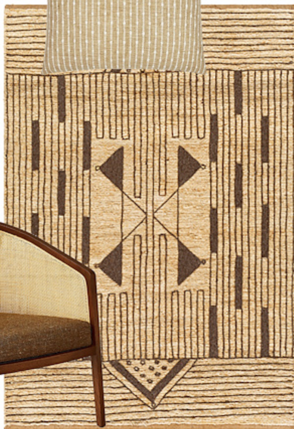
The Brookwood rug from Surya is hand-knotted in India of jute and wool.