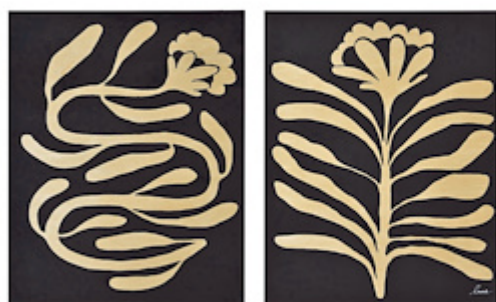
Renwil's Lune artwork is a set of two hand-painted on poly-wood images with a matte black finish.