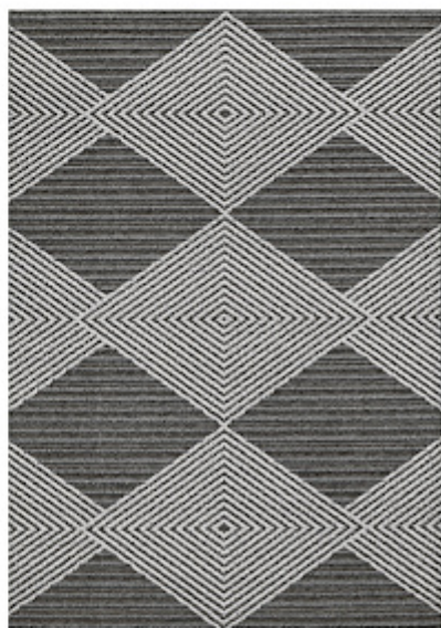
Kas Rugs' transitional Terrace Collection is machine-woven in Turkey with a low pile and is UV-treated. Dallas, Los Angeles, New York