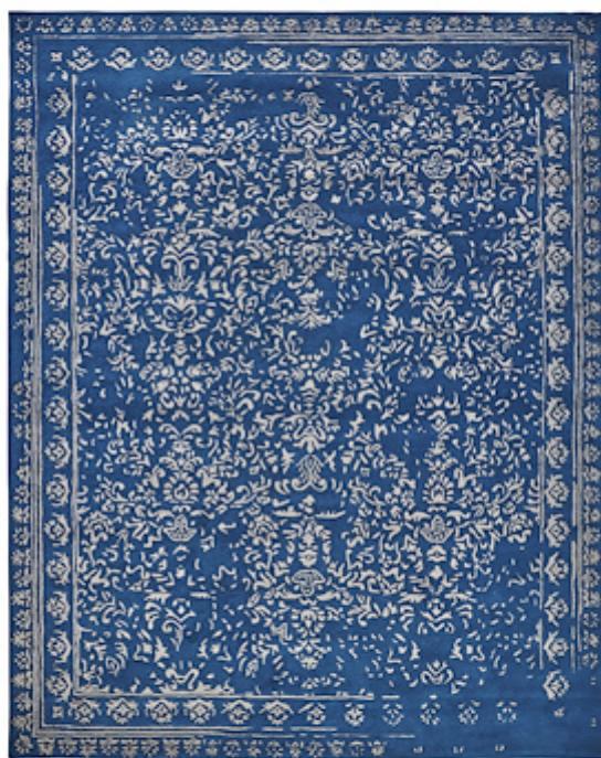
From Feizy's Bella Collection, this rug depicts tonal palettes of floral and leaf patterns in a wool and viscose blend. Dallas