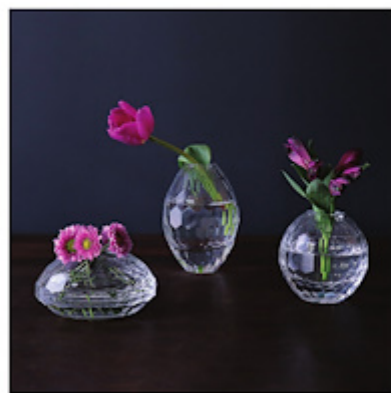
Beatriz Ball's Budvase Collection is available in three colorways—clear, amethyst and smoke. Dallas, Atlanta