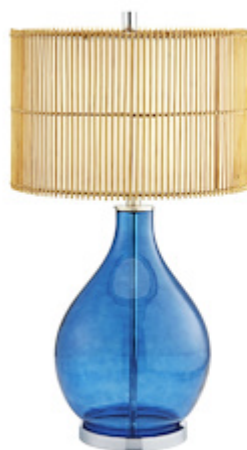
Included in Pacific Coast Lighting's Kathy Ireland Collection, the Bamboo Bay lamp has a sea-blue finish with a chrome base and glass body.