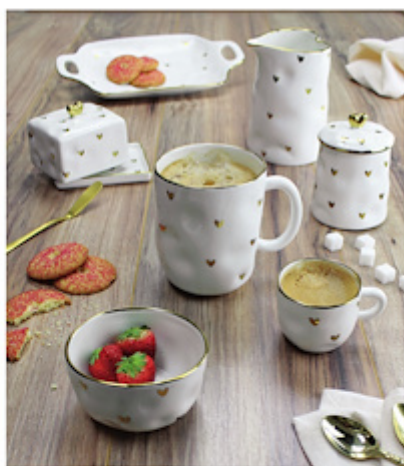
The Heart to Heart Collection from Pampa Bay features porcelain pieces with heart decorations. Food safe, dishwasher safe, freezer to oven to table. Dallas, Atlanta