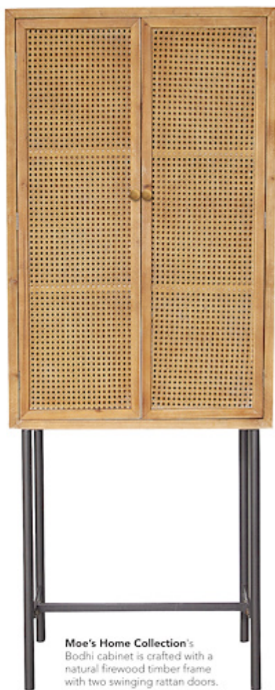
Moe's Home Collection's Bodhi cabinet is crafted with a natural firewood timber frame with two swinging rattan doors.