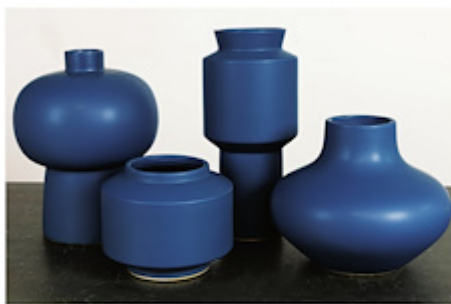
The Import Collection's Cobalt Vase Collection is crafted from ceramic. Dallas