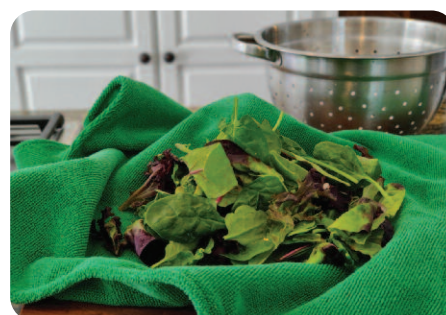
Salad Sling Dries Greens SEE PAGE 8