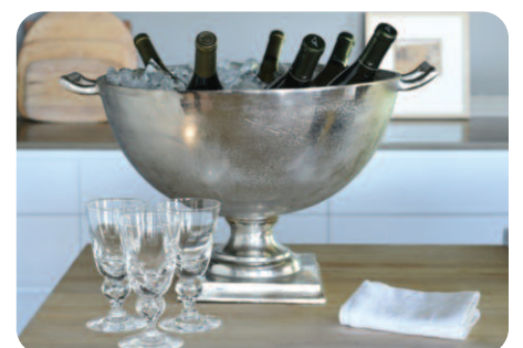
Winter Gift Shows Preview SEE PAGES 12 & 13