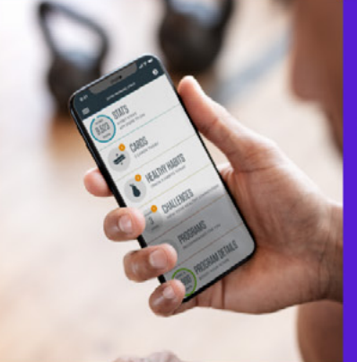
WELLBEING FOR ALL