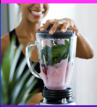
WELLBEING FOR NOW