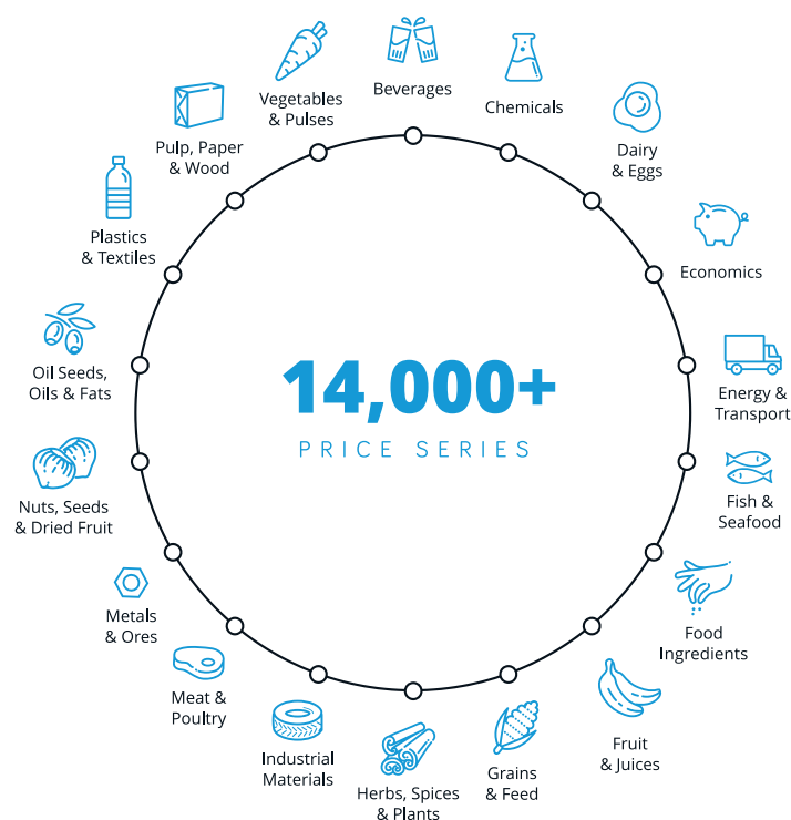
Figure 1: Mintec Commodity Category Coverage