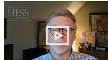
HESS Consortium Collective Overview - Video

We are asked to maximize the effectiveness and efficiency of administrative software services and related information technology to meet the increasing needs of diverse users while minimizing the resources used.