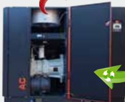
Absorbed electric energy = 100

Mattei offers for its compressors a heat recovery system that allows water to be heated for industrial process or sanitary use.