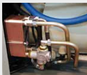
Recovered thermal energy \geq 80