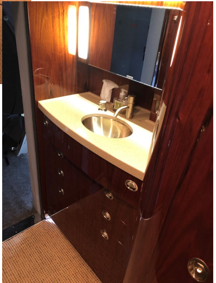
Aft Lavatory Sink

Specifications subject to verification upon Buyer's inspection. Aircraft offered subject to prior sale or removal from market.