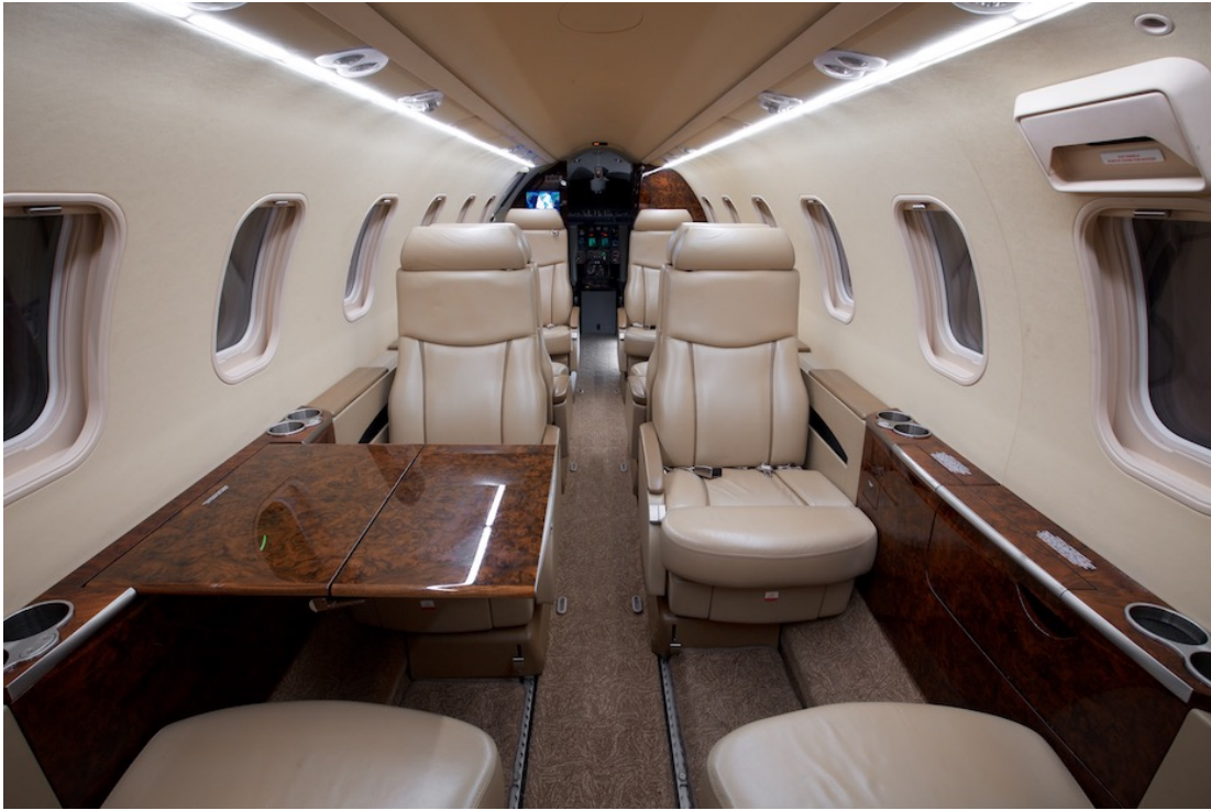
Interior looking forward