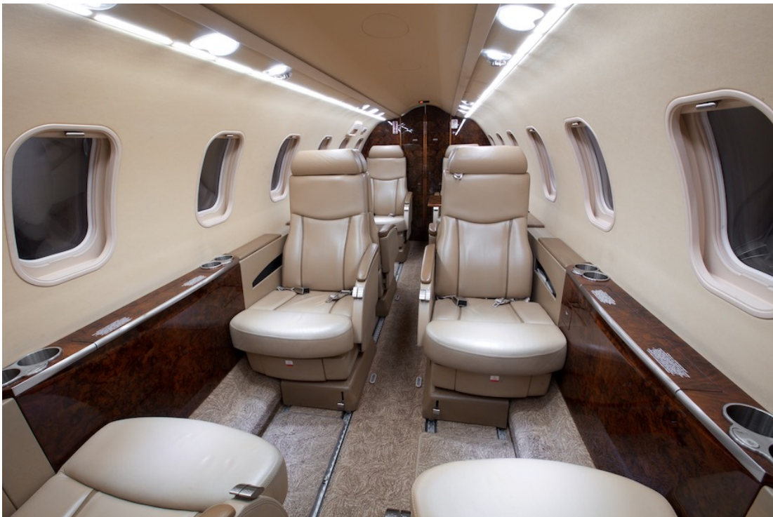
Interior looking aft

Specifications subject to verification upon Buyer's inspection. Aircraft offered subject to prior sale or removal from market.