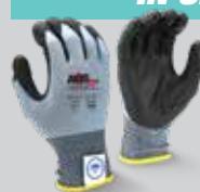
RWGD105 Cut Protection Work Glove

RADIANS OFFERS MANY WORK GLOVES IN SIZES RANGING FROM XS-2XL