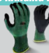
RWG538 Cut Protection Work Glove