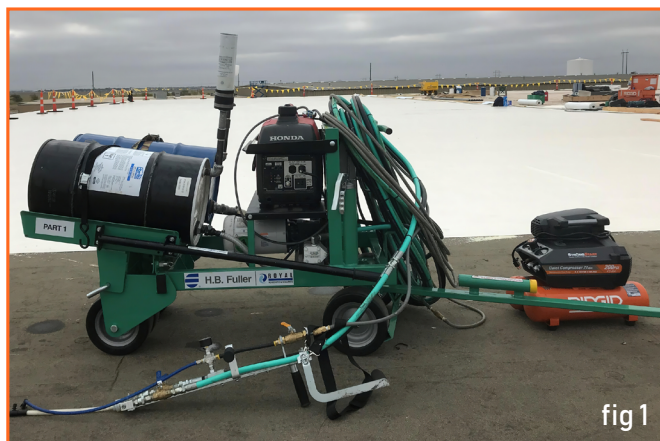
fig 1 - The Cyclone 5/15 VS PLUS by Garlock is a modified Millennium Cyclone and requires a compressor and air-line attached to the mixing tip