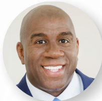
Earvin "Magic" Johnson

Role Model, Sport Legend and Successful Entrepreneur