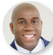
Earvin "Magic" Johnson

Role Model, Sport Legend and Successful Entrepreneur