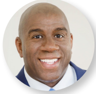
Earvin "Magic" Johnson

Role Model, Sport Legend and Successful Entrepreneur