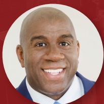
Earvin "Magic" Johnson

Role Model, Sport Legend and Successful Entrepreneur