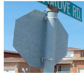
STOP sign mounted to pole using type 201 stainless steel banding, stainless steel buckles and mounting brackets.