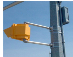
Traffic Signal mounted to utility pole using type 201 stainless steel banding and buckles.