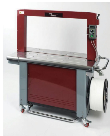
SM65 12MM MACHINE WITH ROLLER TABLES