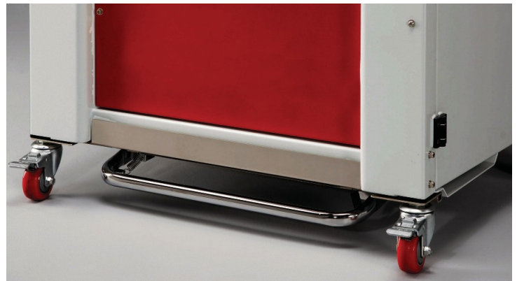
FOOT BAR ACTIVATION