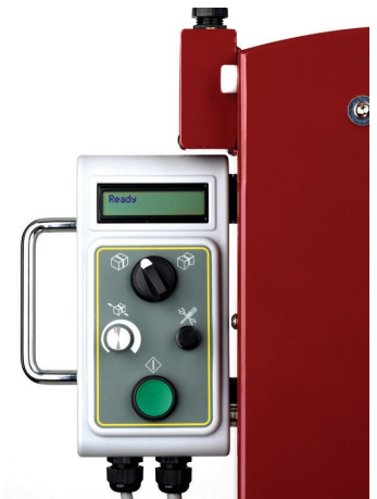
PIVOTING CONTROL PANEL