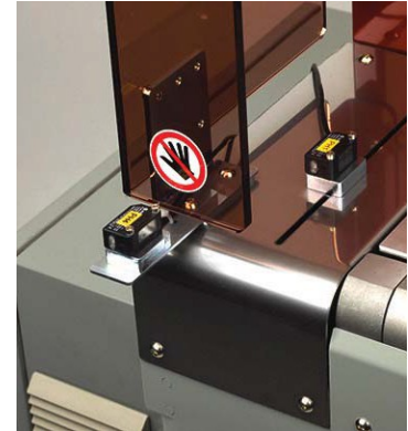
SLEEP MODE SENSOR