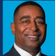
Chris Carter Pro Football Hall of Fame Wide Receiver and TV Commentator