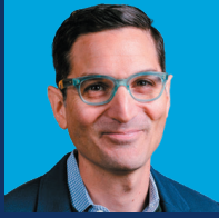
Guy Raz Award-Winning Reporter, Radio & Podcast Host, Author of "How I Built This".