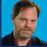
Rainn Wilson Three-Time Emmy Nominated Actor (The Office), NY Times Best-Selling Author