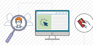
The Fastest Path to Success