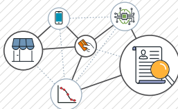
The Best Response Prediction Platform