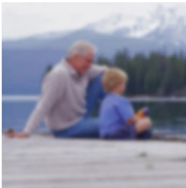
Mavo Foundation for Medical Education and Research