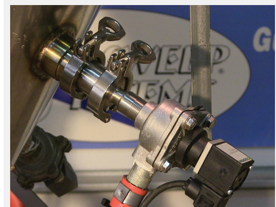
3/4" VA-06-TRI-TRI shown with solenoid valve

The company installed eight VA-12-TRI-TRI units on a trial basis on a ribbon blender and associated hoppers to help streamline their flushing process. Four units were placed on each side of the blender, approximately 1 foot (0.3 m) above the bottom. The tri-clamp mount system of the "TRI-TRI's" allows for installation and removal of the nozzle from the process vessel in seconds, without tools, for fast change-out of components or cleaning/sanitizing. AirSweep Tri-Clamp models are manufactured from 316 stainless steel making them ideal for food processing applications.