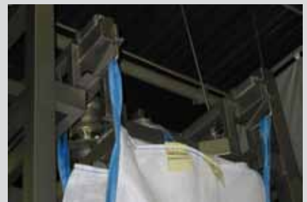
Easy attachment of straps.