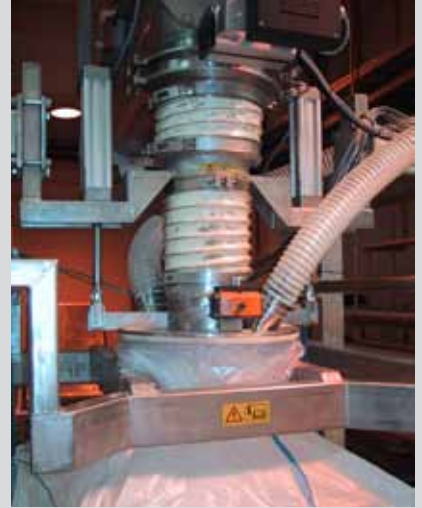
Filling head lowered with big-bag underneath during filling.