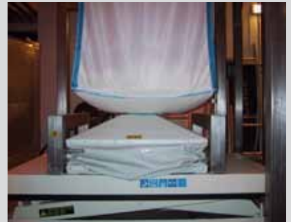
Vibrating table option ensures stable filling.