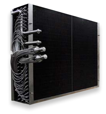
Interlaced Circuit with E-Coat for Industrial HVAC