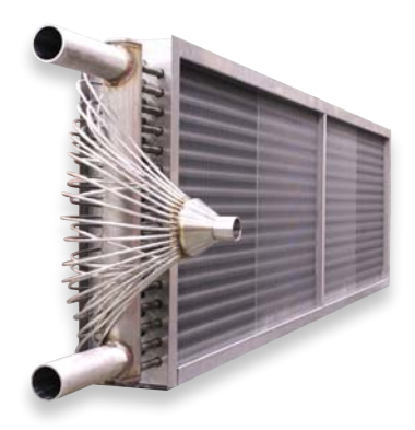
All Stainless Steel for an Industrial Air Handler