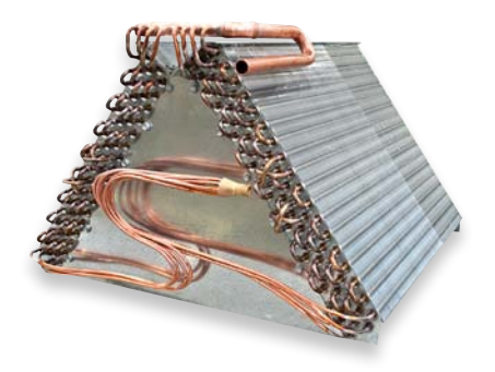
5mm A-Frame Built for Military Comfort HVAC