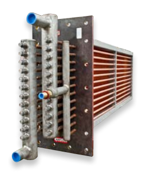
Bare Tubes & Compressed Air Purge Section for Industrial Product Driers