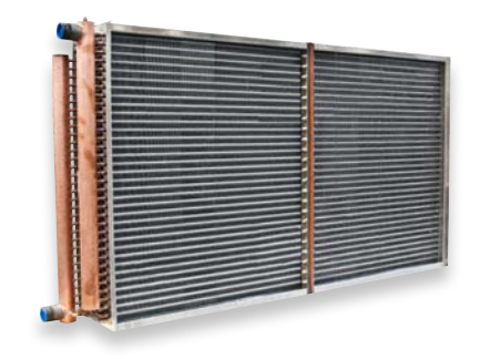
Sectional Split Core for Easy Installation for Commercial HVAC