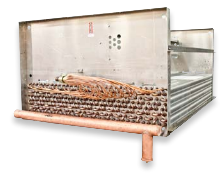
Designed for Environmental Chambers with Ultra Low Temperatures