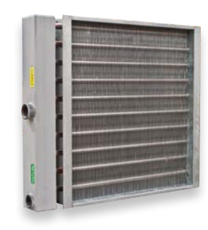
Steam Distributing Coil with Carbon Steel Header for Commercial HVAC