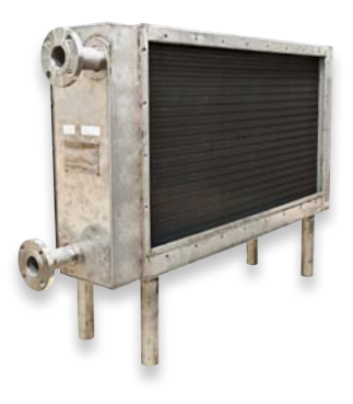
Water Coil with Water Box Header for Industrial Process