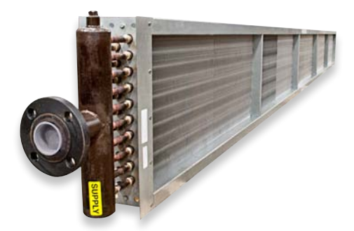
Steam Coil for Vortex Dryer Application