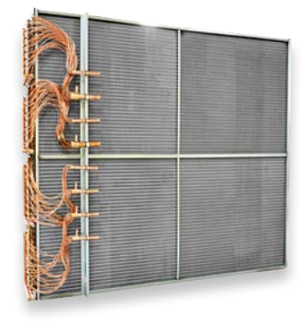
Interlaced Circuiting & Face / Row Split for Commercial HVAC