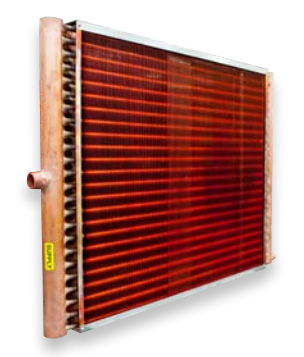
Steam Coil for Industrial Baking Equipment