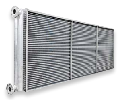
Stainless Steel Headers for Industrial Process Cooling