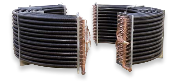
Formed Coil for Industrial Furnaces