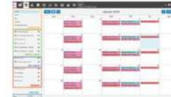
Shared Calendars & More