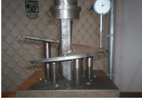
Helix Strength Test