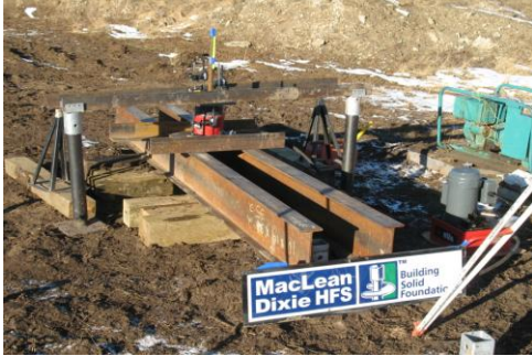
Full scale field testing-compression/tension/lateral

MacLean-Dixie Helical Piles and Anchors undergoing rigorous testing at an IAS accredited lab to ICC AC358 Acceptance Criteria For Helical Foundation Systems and Devices. Ongoing quality control program per AC10 with inspections by an IAS accredited inspection agency per AC98