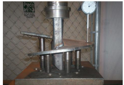
Helix Strength Test