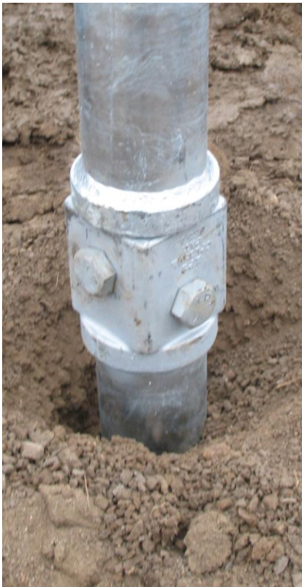
2-bolt Cross Connection

MacLean-Dixie "Strength Squared™" coupling system (Patent pending)