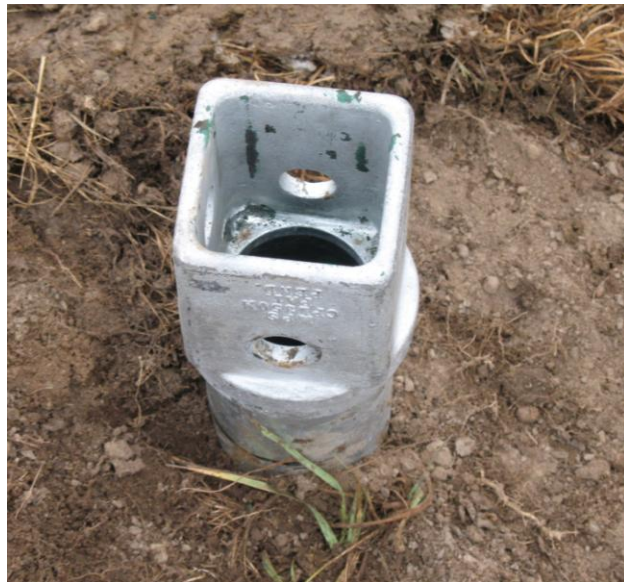
Pipe pile and coupling system remains undamaged during installation

Conventional Pipe Piles - Elongated/torn holes with round pipe pile coupling & bolts in shear.