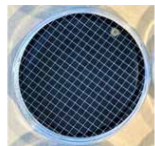
After (example of 5 log reduction)