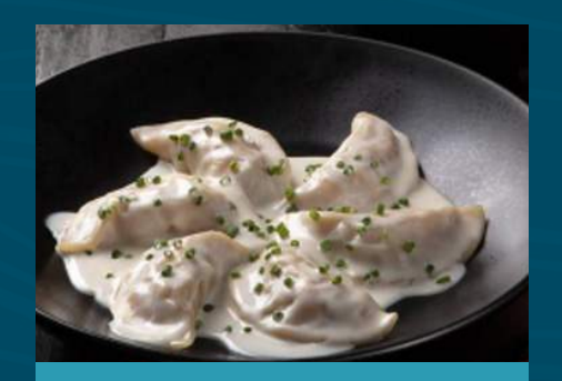
P.F CHANG'S MISO BUTTER LOBSTER DUMPLINGS

In recent years, Maine Lobster has been used more frequently as a versatile ingredient featured in innovative dishes like dumplings, pastas, quesadillas and fondue. In fact, 56% of dishes with Maine Lobster feature it as an ingredient in unique formats vs. as a standalone protein.<sup>4</sup> See the graph below to learn more.