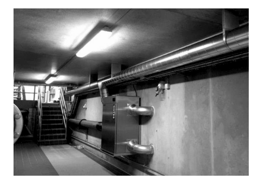
All-Round C35 installed