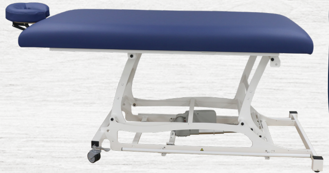
AET-3607 with Dual Foot Bar Control

The elegant design of our Spa Series Ashiatsu Elevating Table is ideal for spas or practices where style is as important as function. This table has been designed with dependability in mind to provide Ashiatsu massage therapists with a unit they can depend on. The top is made with 3" deluxe wrap foam. With safety in mind, we designed the Signature Spa Series Ashiatsu Elevating Table with a 36" width with heavy duty corner support.